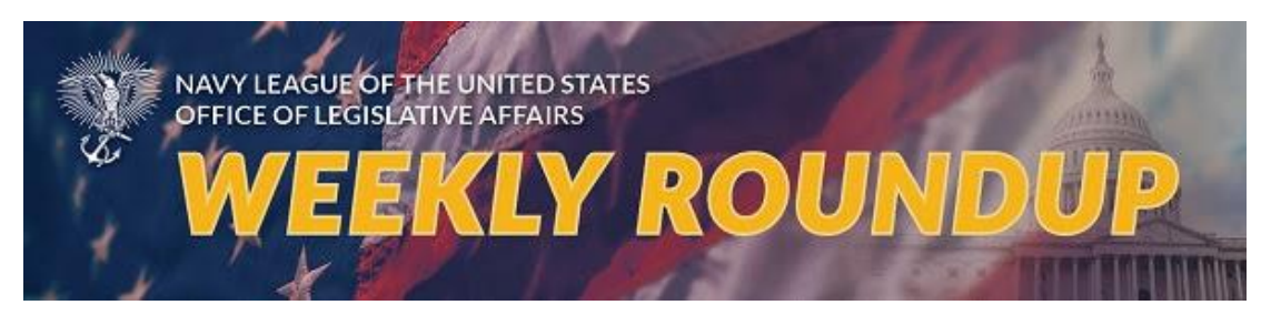
January 7, 2022