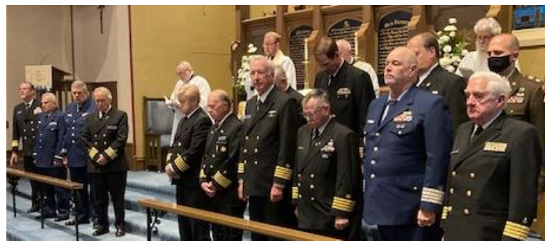
Above: Honor Guard.