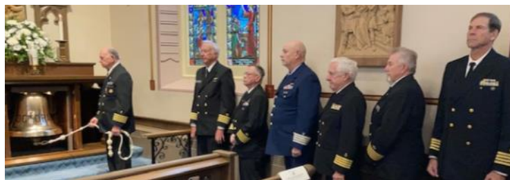
Below: Bell Ringers.