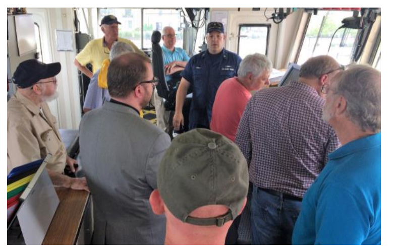
continued next column...