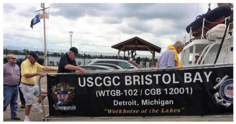
Above: Boarding the USCGC Bristol Bay. Below: Bristol Bay's pilot house..