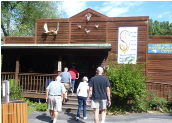
Lodge #4 members arrive at Lake Erie Islands Nature and Wildlife Center.