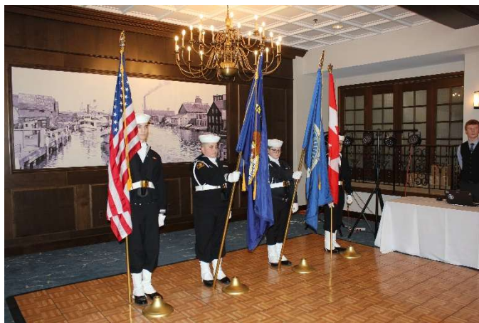
Color Guard performed by the Navy Sea Cadets of the F.C. Sherman Division of Port Huron.