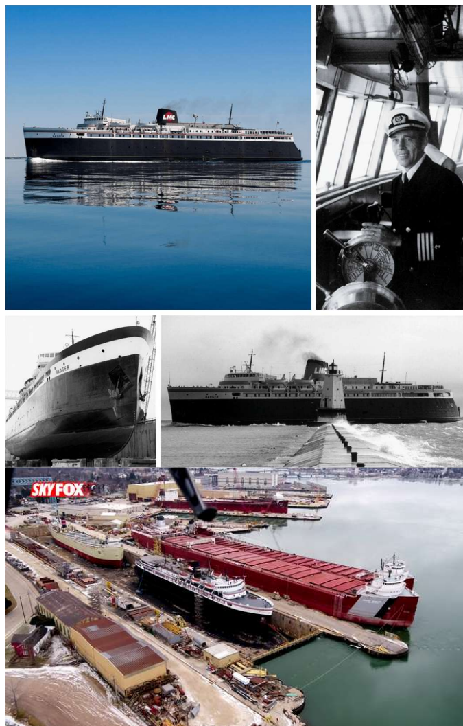
The S.S. Badger undergoes maintenance work at Fincantieri Bay Shipbuilding in Sturgeon Bay Dec. 21, 2021, in the view from SKYFOX.

The season will begin May 16 when it departs Ludington, Michigan for Manitowoc.