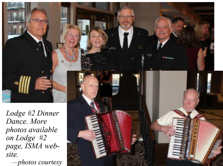
Lodge #2 Dinner Dance. More photos available on Lodge #2 page, ISMA web-site.

Port Huron Lodge #2 celebrated its 127 th Annual Dinner Dance on March 3, 2018, at the DoubleTree Hilton on the St. Clair River. The 79 attendees included six Past Grand Presidents and Grand Lodge officers, with a total of seven lodges represented. A pleasant evening was had by all.