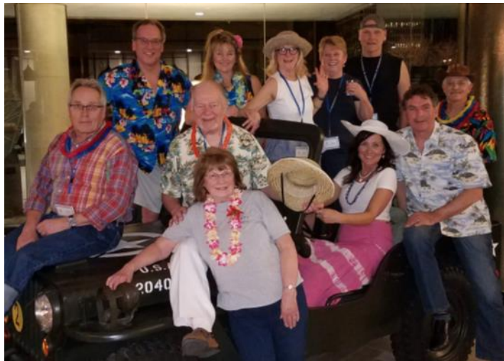
Lodge #2 group on Saturday evening at Toledo Convention.