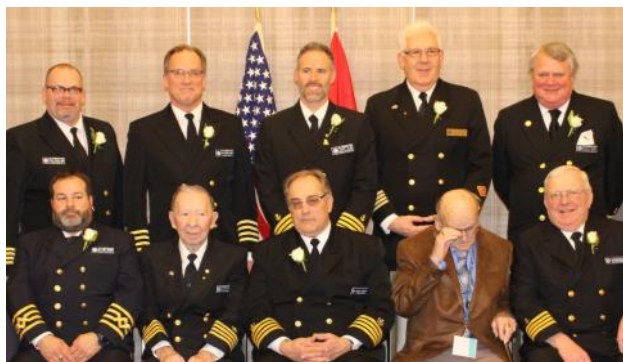
Past Grand Presidents in Attendance at Toledo Convention:

The 2019 Grand Lodge Convention will be hosted by Grand Traverse Lodge #23 in Traverse City, MI, beginning February 7, 2019.